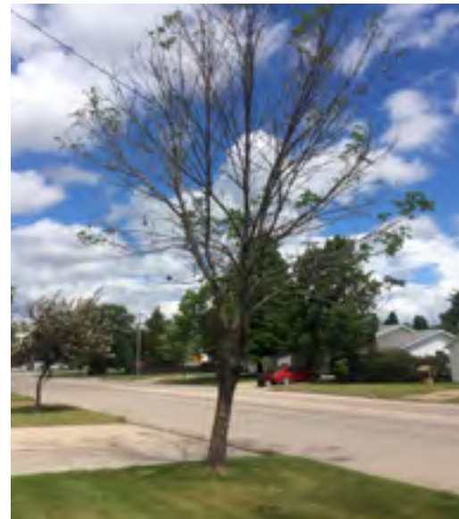
An ash tree that has a severe CAP infestation