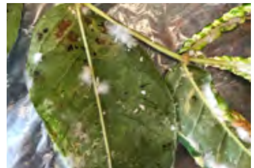
The cottony substance produced by CAPs on the underside of leaves