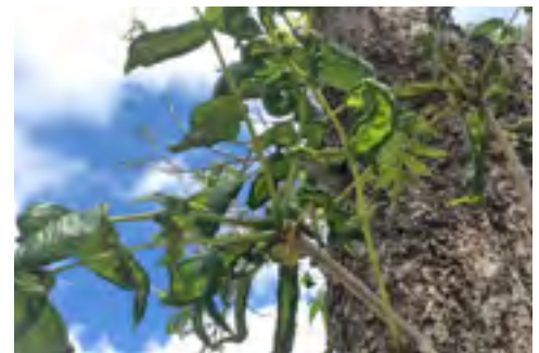
First signs of CAPs are curled leaves with yellow and brown discoloration