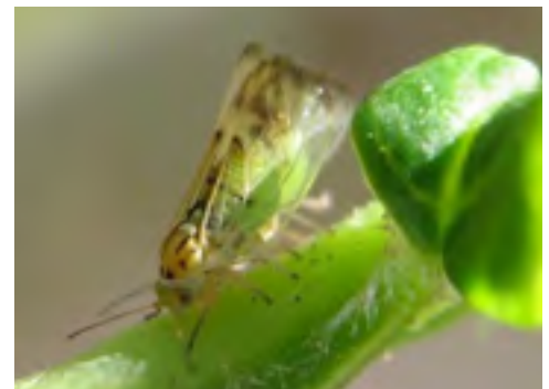
Enlarged image of an adult CAP

Over time, their presence will weaken the ash trees, making them vulnerable to other illnesses and predisposing them to a premature death.