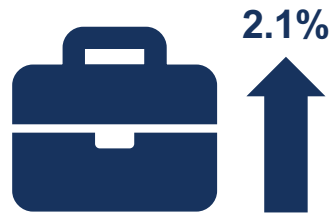
Employment Jun 2023