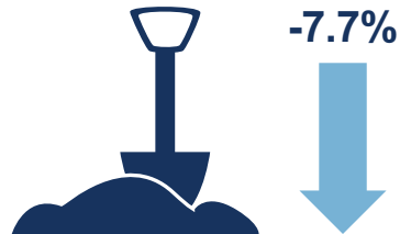
Building Permits May 2023