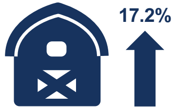
Farm Cash Receipts Q1 2023