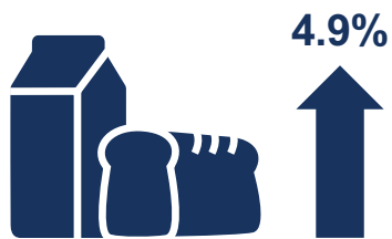
CPI Jun 2023