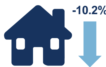
Housing Starts Q1 2023