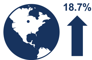
International Exports May 2023