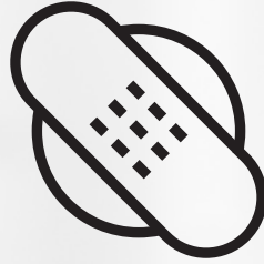
Fully Vaccinated Staff